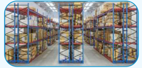
Narrow Aisle Pallet Racking