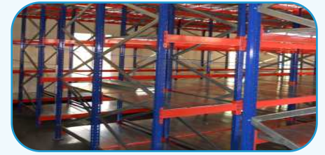
Multi Tier Long Span Shelving Rack