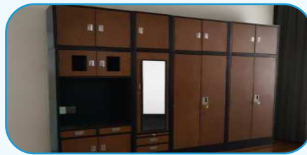
M.S Powder Coated Cupboard