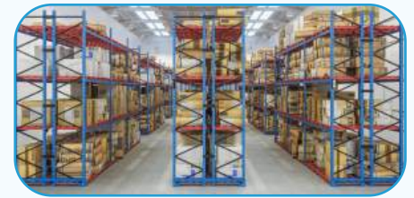
Narrow Aisle Pallet Racking