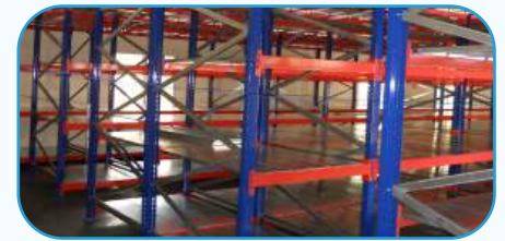
Multi Tier Long Span Shelving Rack