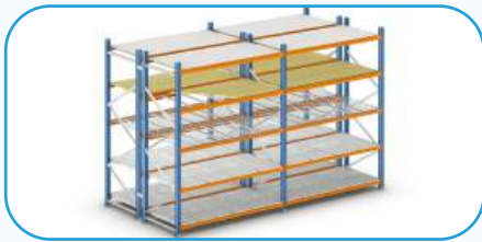
LONG SPAN SHELVING RACK