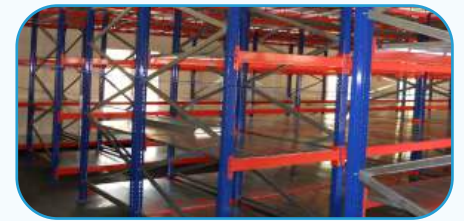
Multi Tier Long Span Shelving Rack