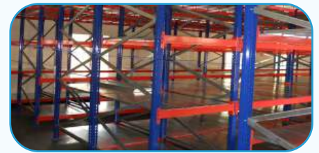
Multi Tier Long Span Shelving Rack