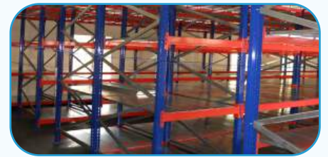
Multi Tier Long Span Shelving Rack