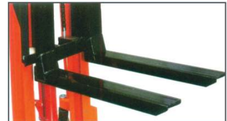
Adjustable forks to coordinate with different requirements