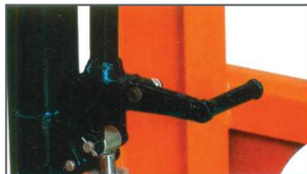
Effortless and quick lifting for using foot pedal without loads.