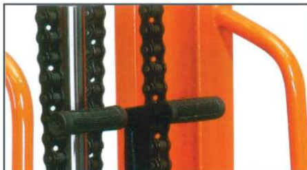
Ergonomic rubber handle ensures a comfortable easy operation.