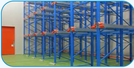
Drive-in Drive Thru Pallet Racking