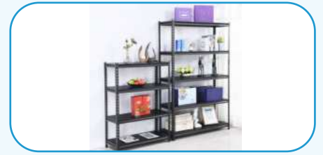
Rivet Shelving Rack