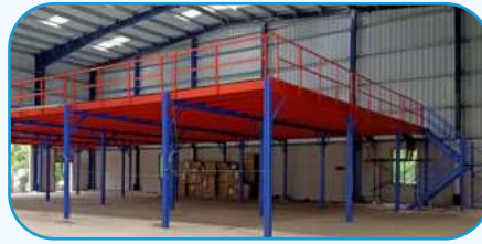
Modular Mezzanine Floor