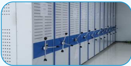
Mobile Shelving Rack, Compactor