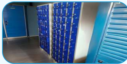
M.S Powder Coated Lockers