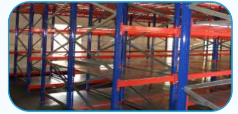
Multi Tier Long Span Shelving Rack