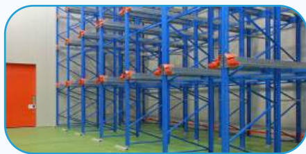
Drive-in Drive Thru Pallet Racking