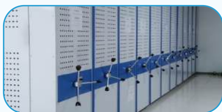
Mobile Shelving Rack, Compactor