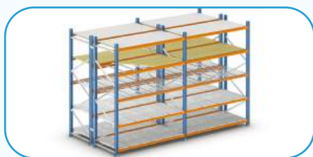
LONG SPAN SHELVING RACK