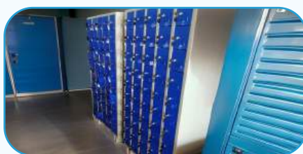
M.S Powder Coated Lockers