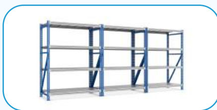
Boltless Long Span Shelving Rack