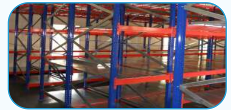
Multi Tier Long Span Shelving Rack