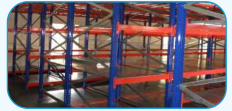
Multi Tier Long Span Shelving Rack