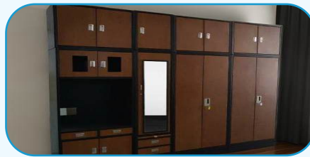
M.S Powder Coated Cupboard