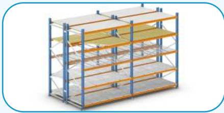
LONG SPAN SHELVING RACK