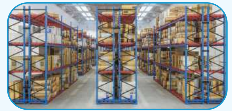
Narrow Aisle Pallet Racking