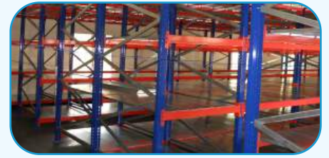
Multi Tier Long Span Shelving Rack