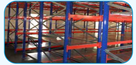
Multi Tier Long Span Shelving Rack