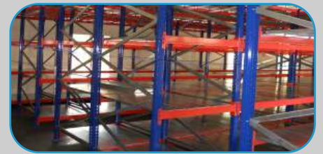
Multi Tier Long Span Shelving Rack