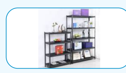
Rivet Shelving Rack