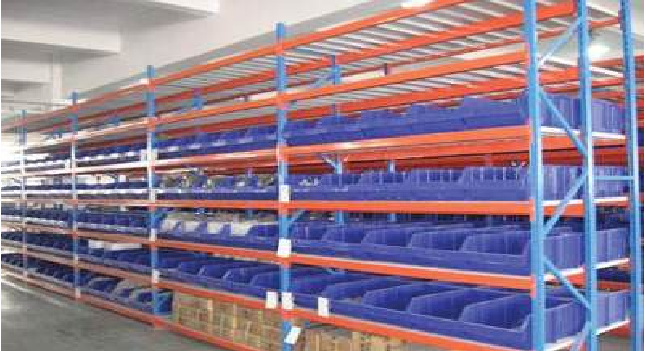
Long Span with Plastic Bins