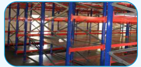
Multi Tier Long Span Shelving Rack