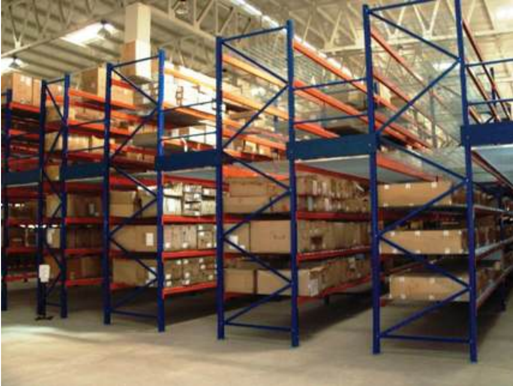
Long Span with Multi-tier Racking Systems