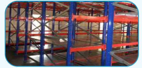
Multi Tier Long Span Shelving Rack