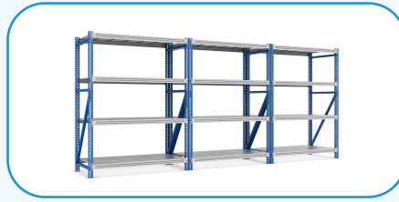
Boltless Long Span Shelving Rack