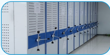
Mobile Shelving Rack, Compactor