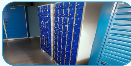
M.S Powder Coated Lockers