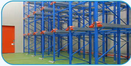
Drive-in Drive Thru Pallet Racking