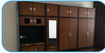
M.S Powder Coated Cupboard