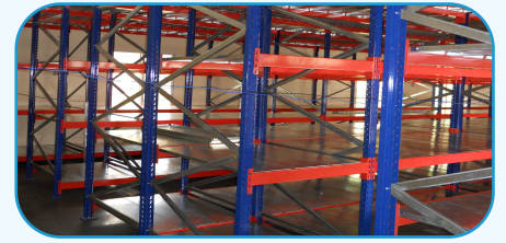
Multi Tier Long Span Shelving Rack