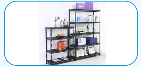
Rivet Shelving Rack