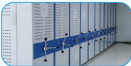
Mobile Shelving Rack, Compactor