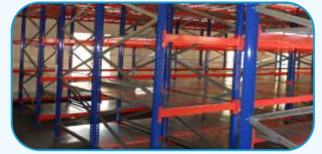
Multi Tier Long Span Shelving Rack