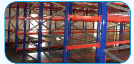
Multi Tier Long Span Shelving Rack