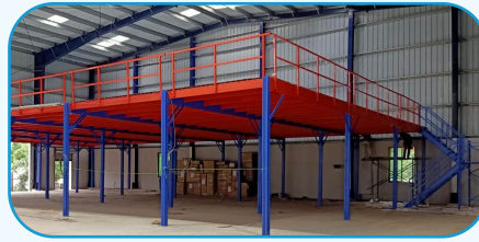
Modular Mezzanine Floor