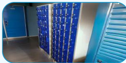
M.S Powder Coated Lockers