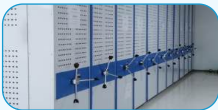
Mobile Shelving Rack, Compactor