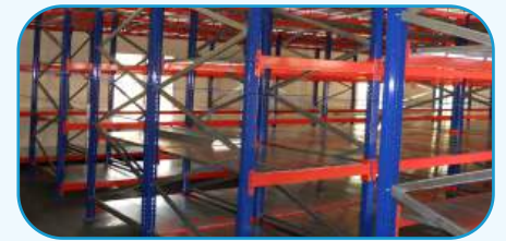
Multi Tier Long Span Shelving Rack