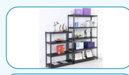
Rivet Shelving Rack