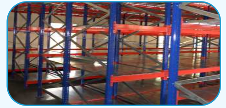
Multi Tier Long Span Shelving Rack