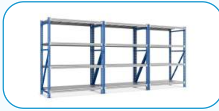
Boltless Long Span Shelving Rack