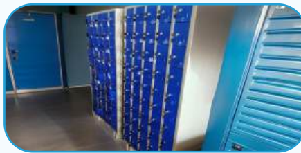
M.S Powder Coated Lockers