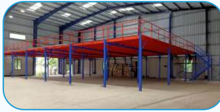
Modular Mezzanine Floor