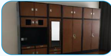
M.S Powder Coated Cupboard