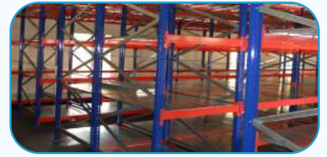
Multi Tier Long Span Shelving Rack