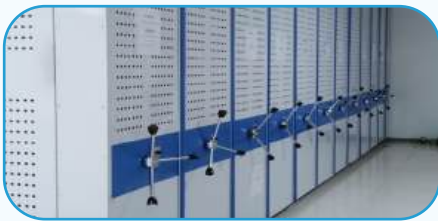
Mobile Shelving Rack, Compactor