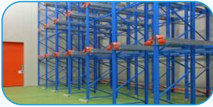
Drive-in Drive Thru Pallet Racking