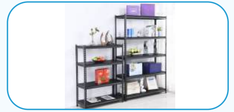
Rivet Shelving Rack